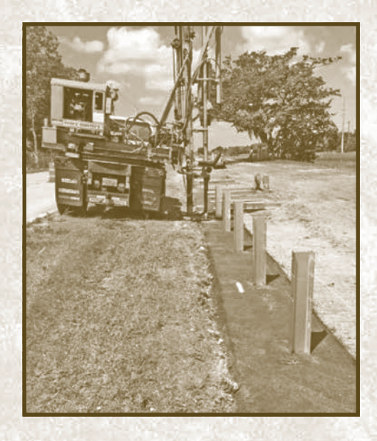
The installation of quardrail along Griffin Road

Southwest 202nd Southwest 205th Southwest 209th.